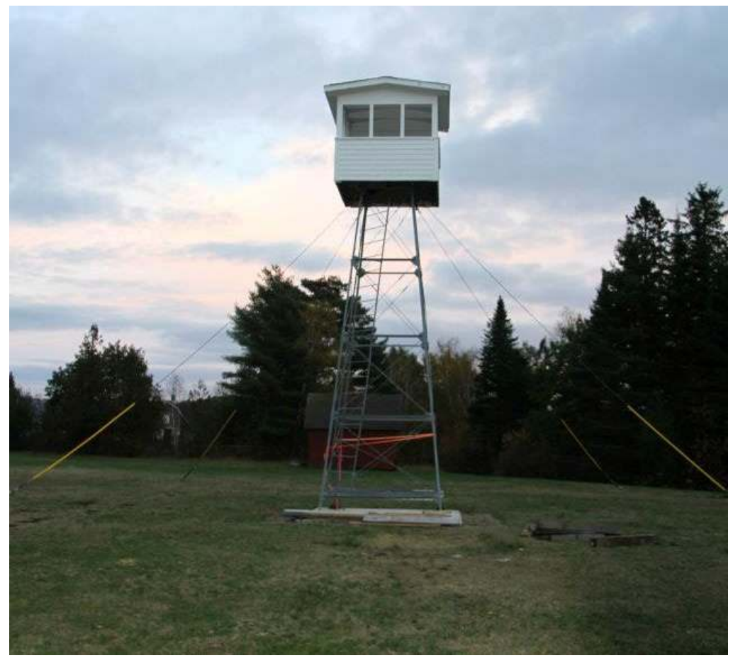
Norway Bluff – almost finished product; October 2012

Norway Bluff , removed as part of the MSCommNet Project. The Tower was moved in 2 phases to the Ashland Logging Museum. Phase 1 was the removal from the mountain on 5/7/2012 and Phase 2 was the actual moving of it to the Museum on 6/13/2012. The museum staff, current and retired Maine Forestry staff all helped to make the move a reality. The final product looks great! There will be a dedication and ribbon cutting in the summer of 2013.