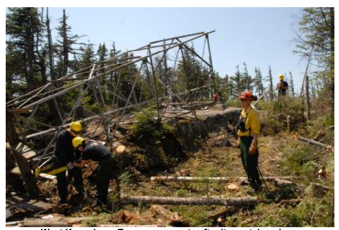
West Kennebago Tower – moments after it was taken down

West Kennebago Mountain, removed as part of the MSCommNet Project. On Saturday 5/19, the Maine Forest Service was to fly the tower and cab to a gravel pit for the purposes of saving it. The tower was scheduled to be removed in the spring of 2012 to make way for a new communications tower. FFLA was looking for a location to take the tower as an exhibit and had at least one good lead. Unfortunately, it turned out that the steel was too heavy for the Helicopter and it could not be safely lifted. The cab was also too rotted to transport, so the tower had to be cut down in pieces. Ultimately, the tower and cab were sent to scrap as there was no possibility of saving it.