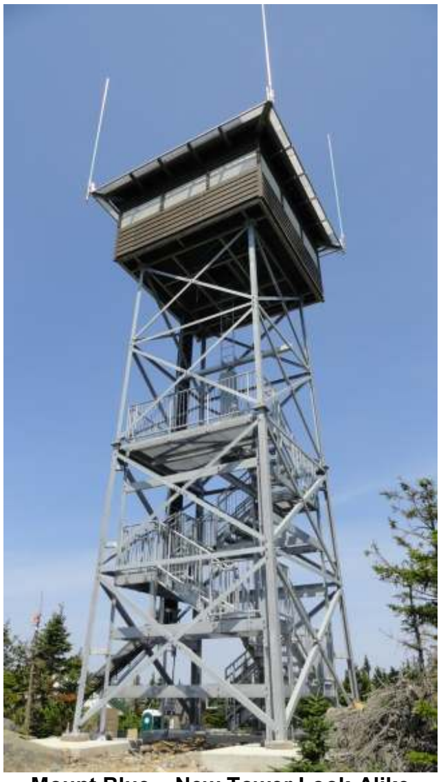
Mount Blue - New Tower Look-Alike

In July, the new fire tower construction on Mount Blue in Weld was complete, so I set out to hike up and check out this new tower lookalike. In Mount Blue State Park, the 1.6 mile trail leaves at the end of the Mount Blue Road and is moderate for most of the way. Just under half way up, a short trail leaves left to the old watchman's camp which still stands. The camp is in bad shape, but the main structure still stands and can be entered at your own risk. Arriving at the summit, a new fire tower stands alongside a radio building built to resemble a warden's shelter. The tower has a traditional cab on it, with window look-alikes. The cab is not accessible, but holds or disguises 4 microwave antennas. A wrapping staircase leads you to an observation platform which delivers 360 degree views. Previous to this tower, views were limited due to summit growth.