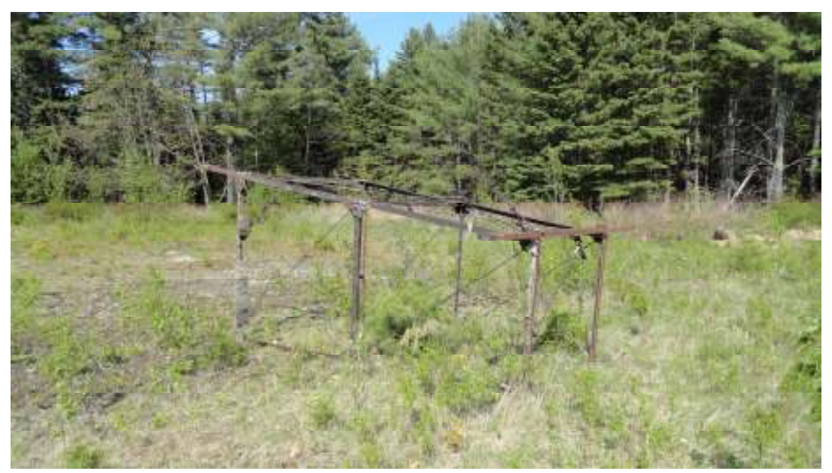
Big Moose Tower lays in a field next to the NREC facility on RT15 in Greenville

Back in 2011, the Natural Resource Education Center (NREC) in Greenville agreed to accept the tower and place it at their new visitor center on RT15 in Greenville. The initial plan was to restore and erect the tower on site as an exhibit. The project has run into serious insurance liability challenges. Currently, the project is on hold pending a new plan that satisfies the insurance carrier. For now, the tower lays on its side in the clearing next to the building.